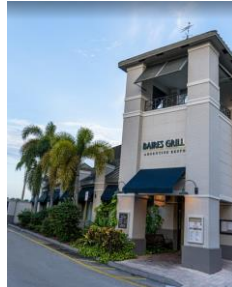
Baires Grill 2210 Weston Road Weston, Florida 33326